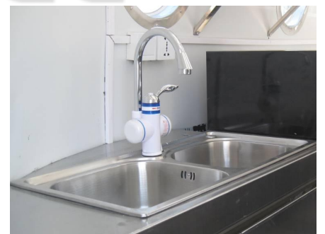
- Sinks -