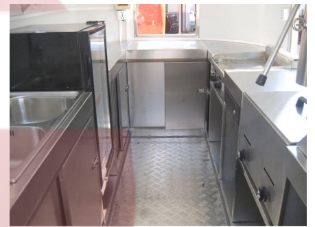
- Inside -