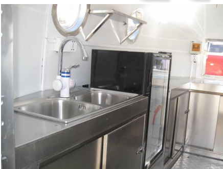
- Kitchen Equipment -