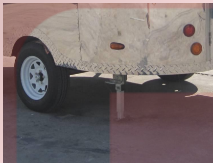
- Stabilizer -