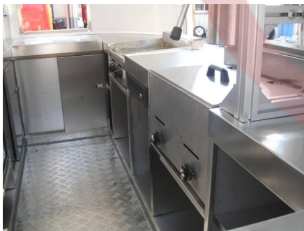
- Kitchen Equipment -