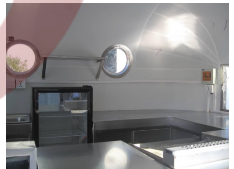
- Interior -