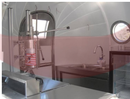
- Churros Machine -