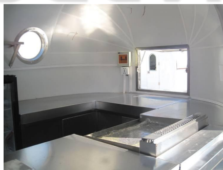
- Counter -