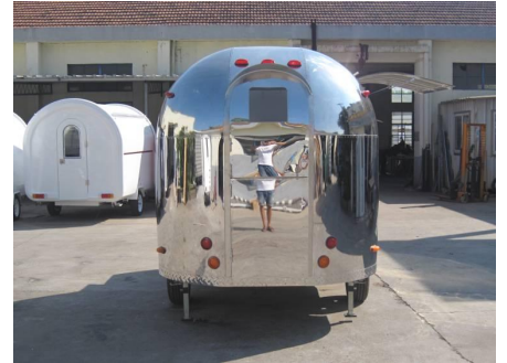
- Door -